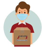
Our Team comes with personal Safety Equipments