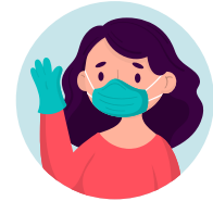
Wear Masks & Gloves at all times