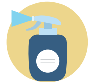
Disinfect frequently touched objects